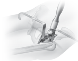
Femoral Head Impaction