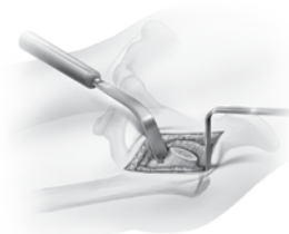
Proximal Femoral Exposure

The images below provide highlights of the efficient technique.