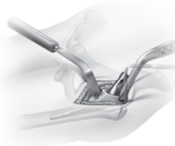
Femoral Stem Insertion